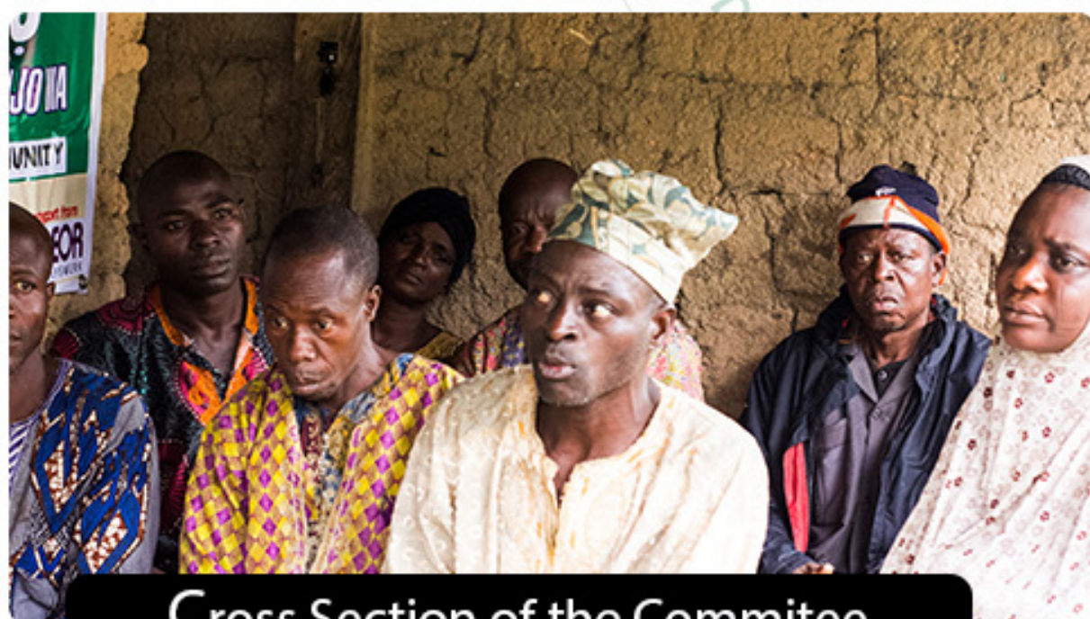
Cross Section of the Committee members in Igbajo Community

Discussion held on issues concerning the challenges being faced by the communities