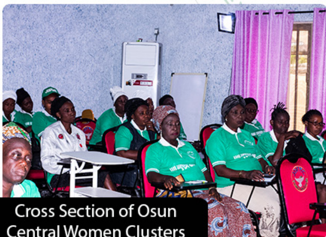
Cross Section of Osun Central Women Clusters