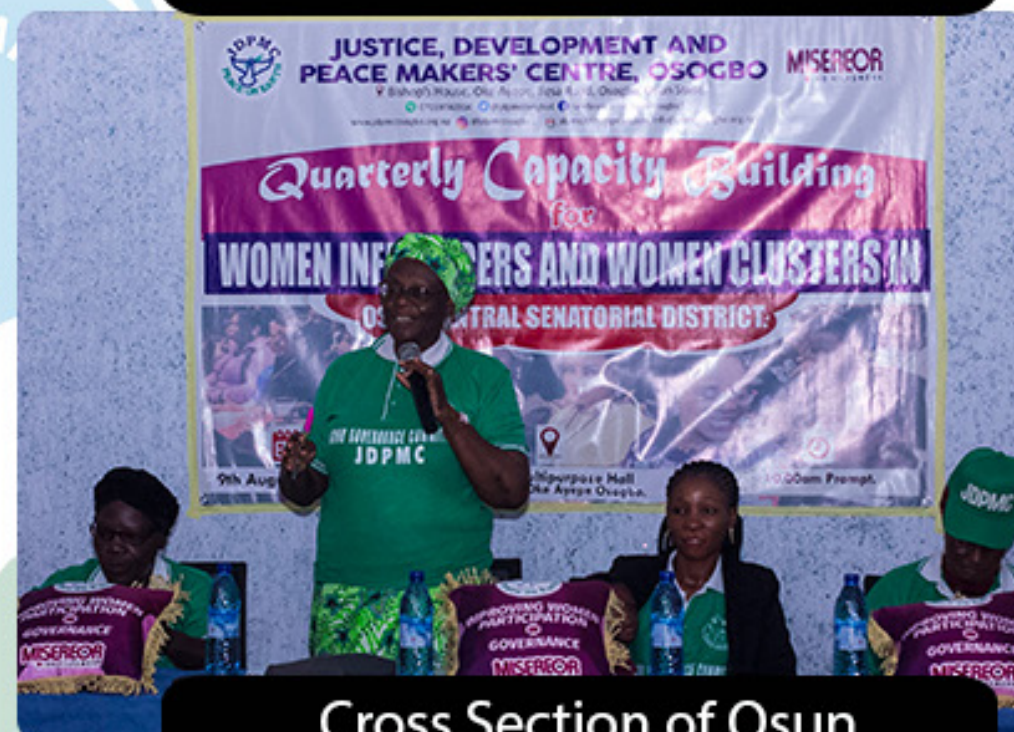
Cross Section of Osun Central Women Influencers