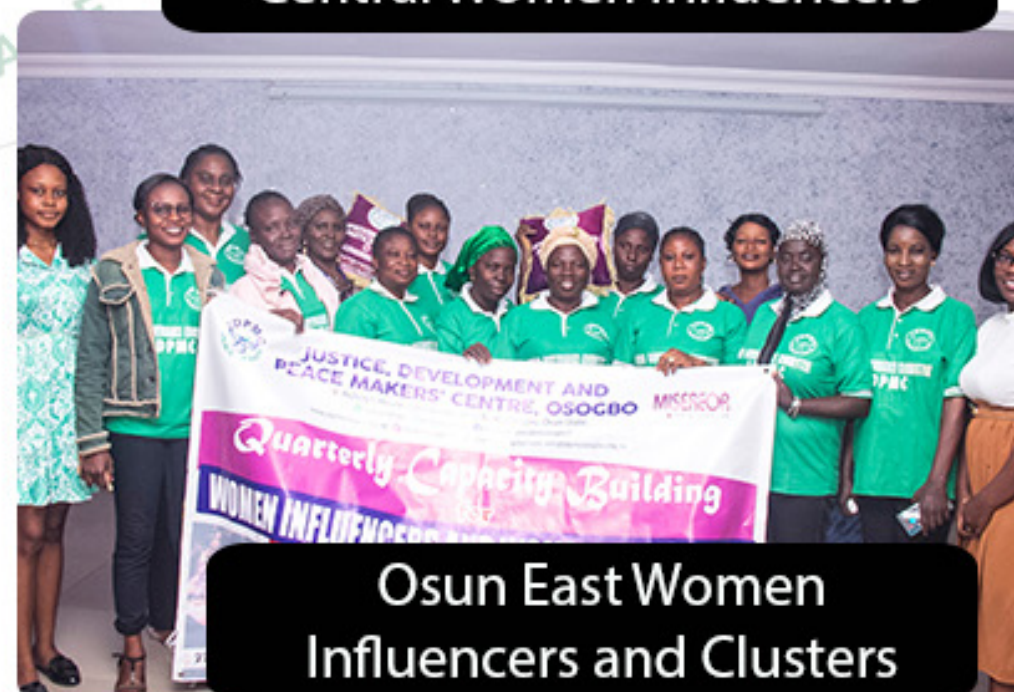
Osun East Women Influencers and Clusters