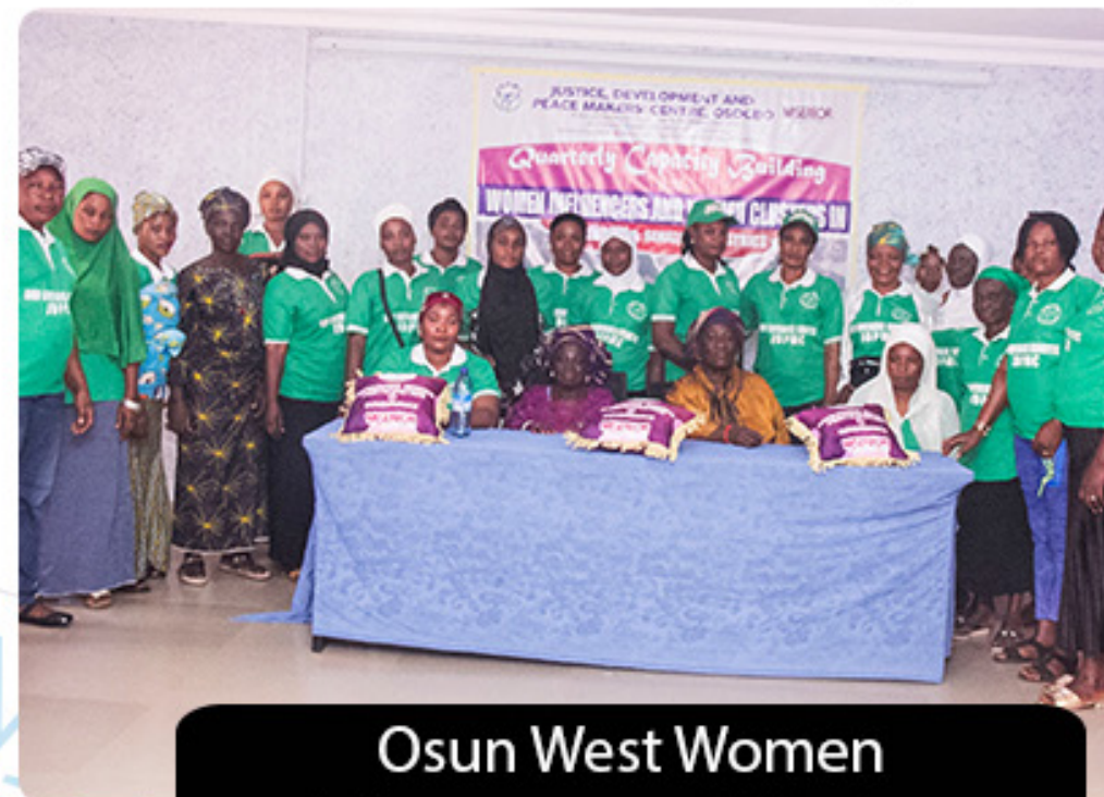
Osun West Women Influencers and Clusters

The topic of discussion was focused on identifying community issues and proffering solutions to it. 69 participated attended the capacity building training