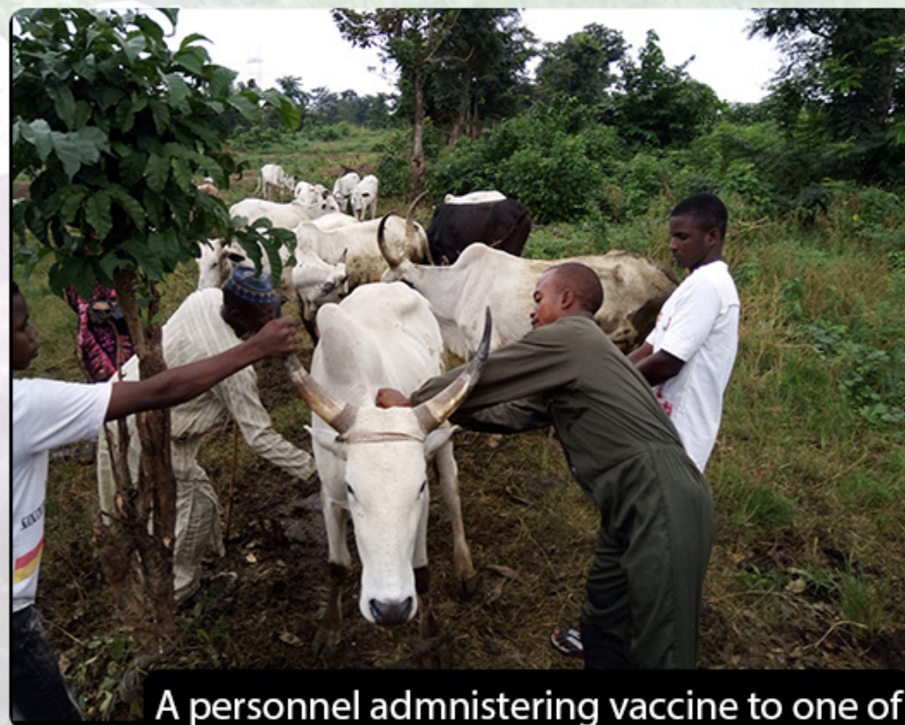
A personnel admnistering vaccine to one of the cattles in Adejuwon community

These communities were sensitized on the impact of diseases on animals such as Contagious PleuroPneumonia, Foot & Mouth Disease, Mange/Tick Infestation, African Swine Fever and better management technique was proffered.