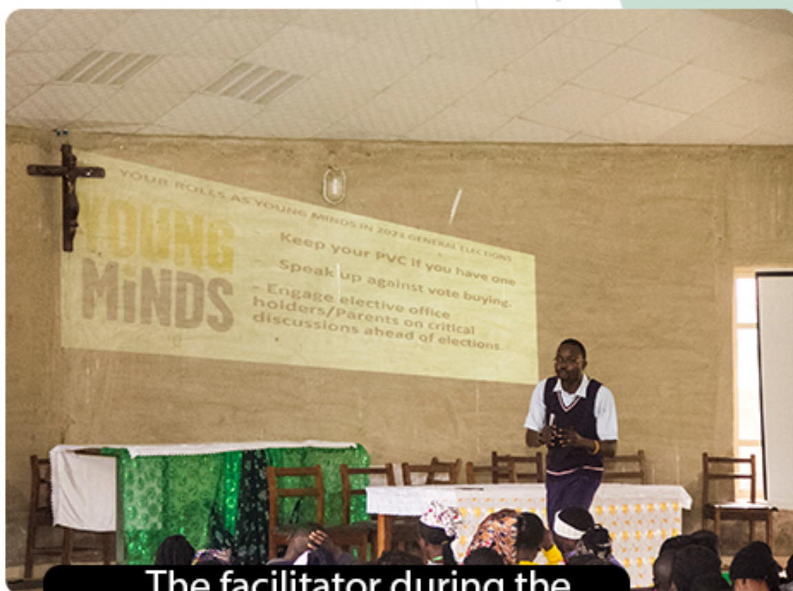
The facilitator during the interactive session

The 2 facilitators from JDPMC sensitized the youths on: