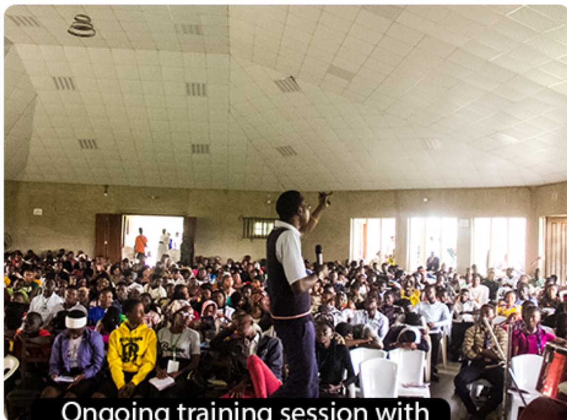
Ongoing training session with the youth at the doctrinal week

The Democracy and Good Governance Programme of JDPMC trained over 800 youths during their annual Doctrinal week 2022 held at Pastoral Centre, Ede.