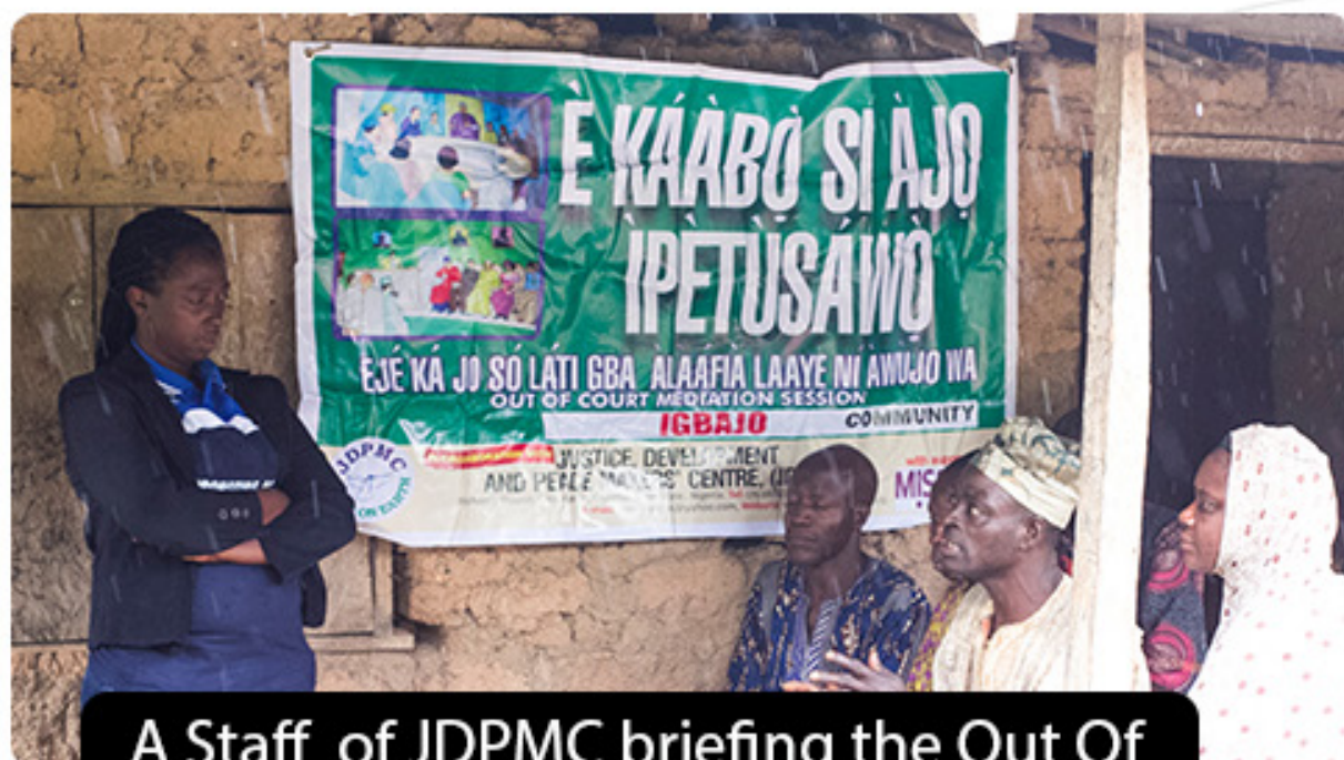
A Staff of JDPMC briefing the Out Of Court Mediation team in Igbajo

The Justice and Human Rights Programme of JDPMC paid a visit to Community- Based Out of Court Mediation Committees of Igbajo and Ipetumodu