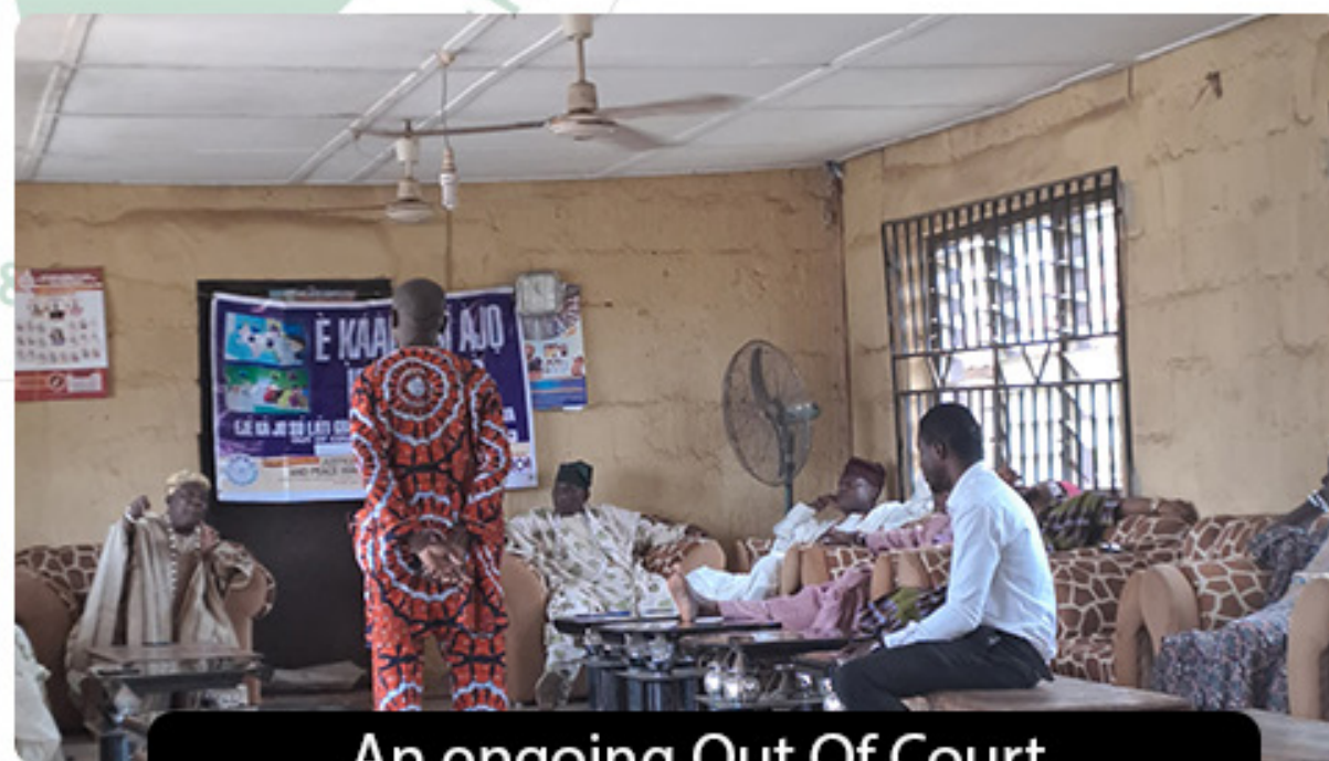
An ongoing Out Of Court Mediation session in Ipetumodu